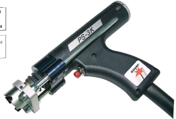
带支撑的PS-3K螺柱焊枪 PS-3K stud welding gun with support