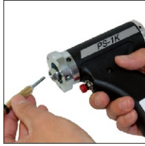
PS-1K contact welding gun with quick-change system for gun support tubes.